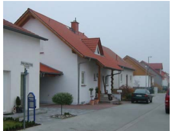
Single Family house with standard insulation values

Architect Passive house: faktor 10, Folkmer Rasch und Petra Grenz, Darmstadt